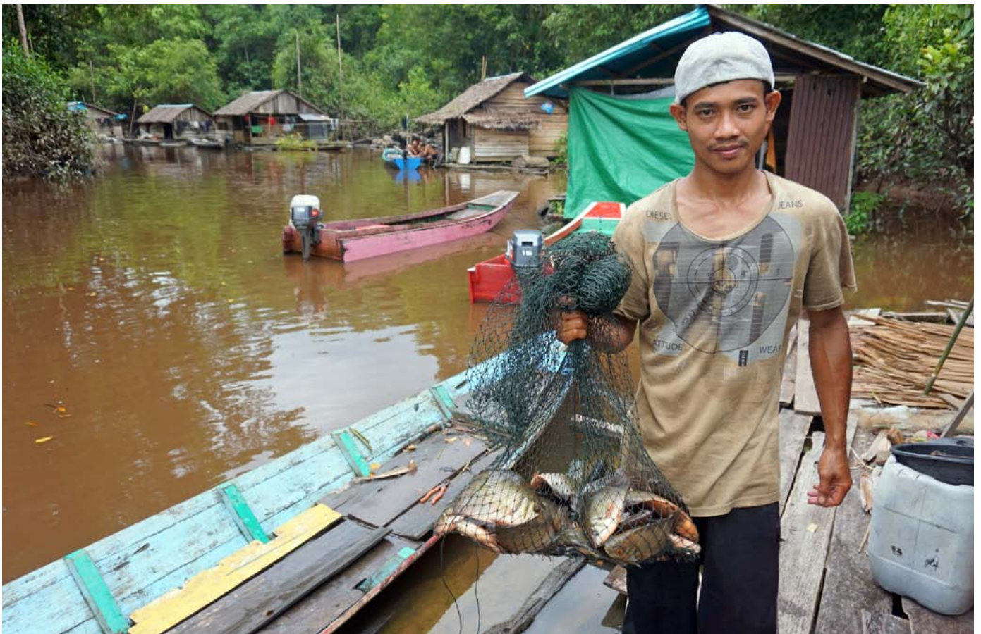
Fishers in Sambas River.

The fight to reclaim water from oil palm plantations in Indonesia