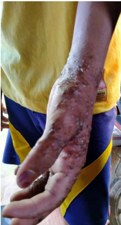
Crude Palm Oil spill in Sajingan Kecil River. Since September 2020, around 300 villagers (mostly women and children) have been suffering from skin diseases, presumably from plantation waste that pollutes the river.